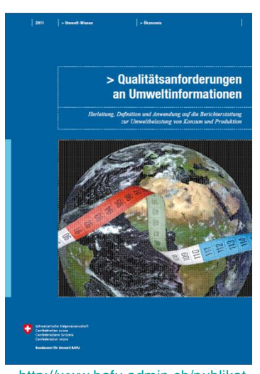
http://www.bafu.admin.ch/publikat ionen/publikation/01623/index.ht ml?lang=en

Intergovernmental Dialogue on Quality data availability for policy making